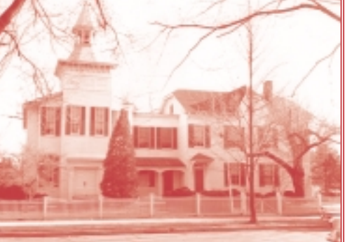
and design – Talbot's County's First Public High School 106 South Street

1684 and reputed to be Maryland's oldest frame building – open daily to public. See the interior construction